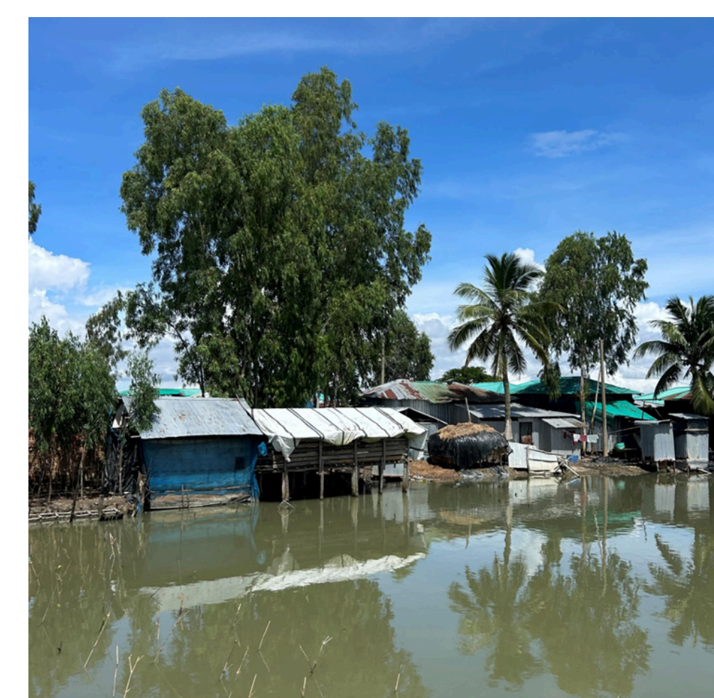
Recent flooding in Chakaria