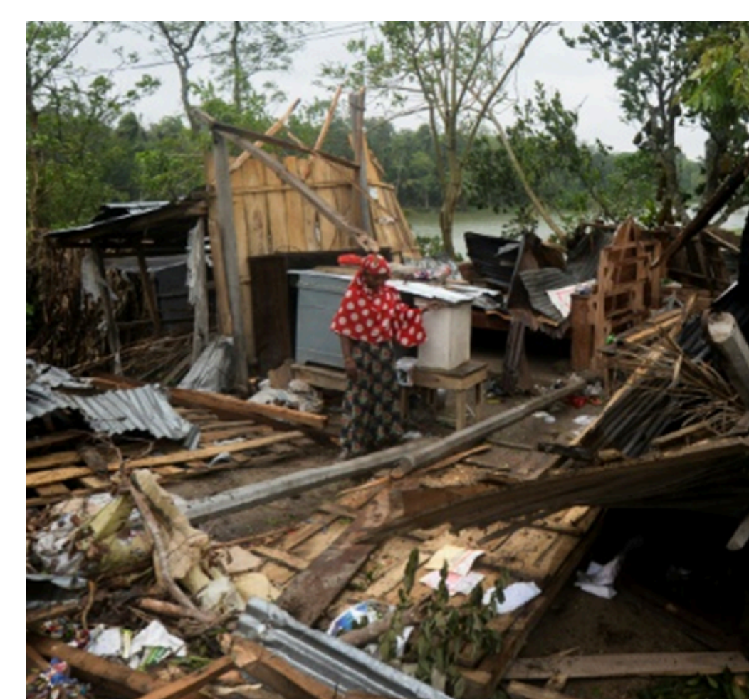
Homes destroyed due to a recent cyclone in Chakaria