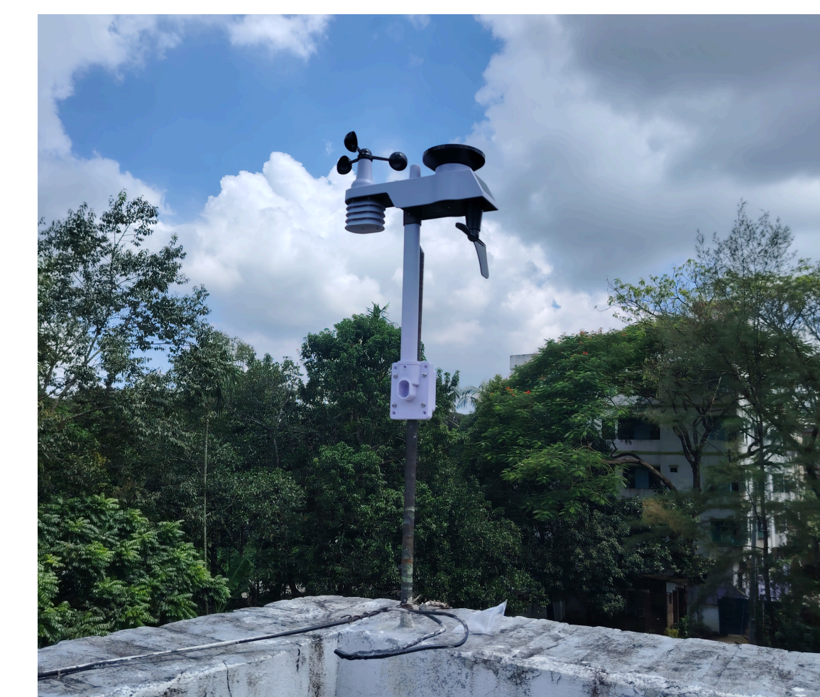
Weather station installed on top of the icddr'b office in Chakaria