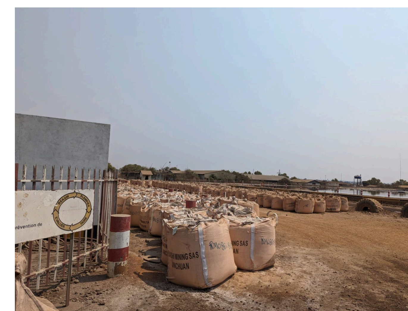
Near the city of Lubumbashi, bags of crude cobalt hydroxide await road transport to African ports before being shipped to China.

Legal recognition based on historical presence, economic contribution, and livelihood necessity, not licensing compliance. End criminalization of ASM on industrial concessions. Rights secured through arbitration frameworks.