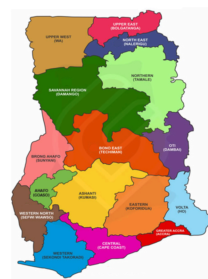
Map of Ghana Study Sites: Kumasi (urban) & Techiman (rural)