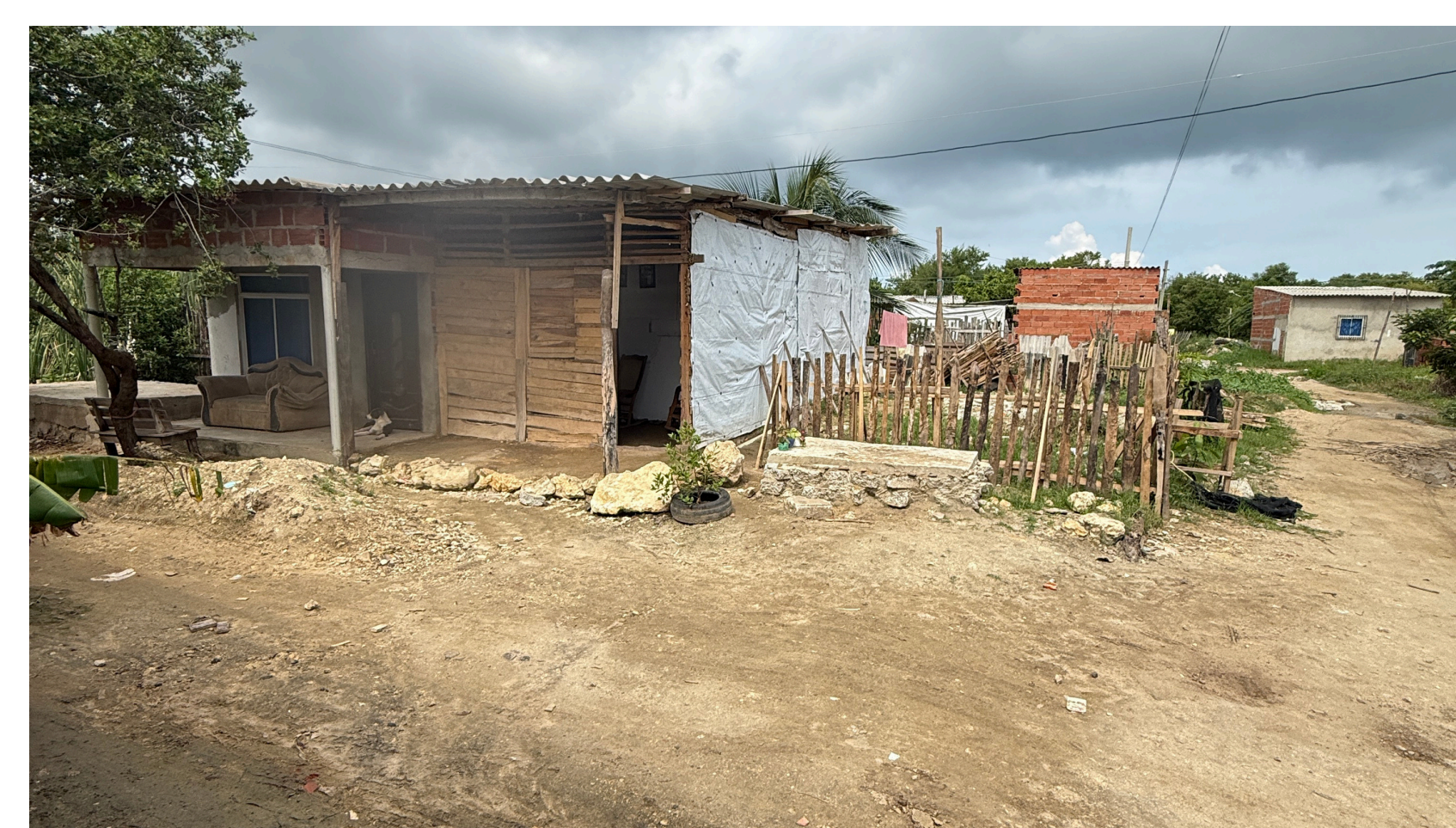
Flat, low-lying informal settlement in Barranquilla — wooden homes, unpaved roads, and limited drainage infrastructure increase flooding and heat exposure risk.