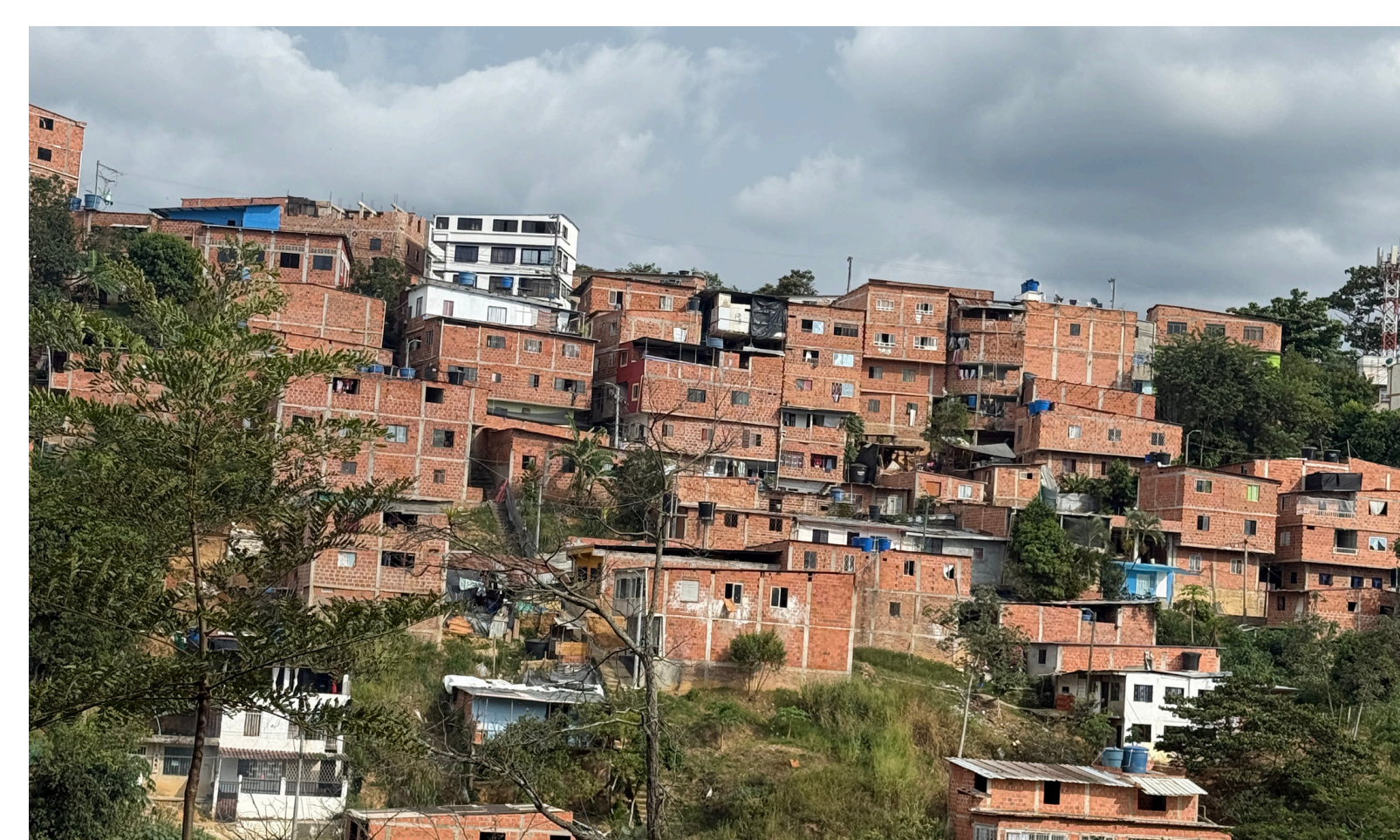
Dense hillside settlement in Bucaramanga — multi-story self-built homes reflect generational vertical expansion, while steep terrain creates persistent landslide risk.

Acknowledgements: We thank the community members in Bogotá, Bucaramanga, and Barranquilla who generously shared their experiences with us. We are grateful to the Junta de Acción Comunal leaders in Bogotá and Bucaramanga for their support in planning this work, to Fundación Alfarero for their coordination in Barranquilla, and to our field survey team.